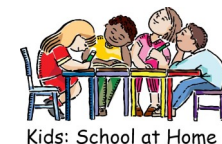
Kids: School at Home

The Catholic Steward and Catholic Stewardship Consultants