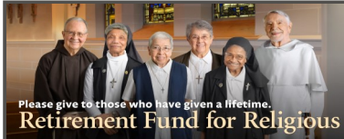
Please give to those who have given a lifetime. Retirement Fund for Religious

Do you bear good fruit for Jesus? Do you spend time in prayer or do you waste it with mindless activity? Do you use your talent to help others or are you too busy? Do you use your treasure to support the Church or do you buy more things that go unused. Our time, talent and treasure are gifts from God. What we do with these gifts is our gift back to Him. What gifts are you planning to give to the Lord during this upcoming Christmas season?