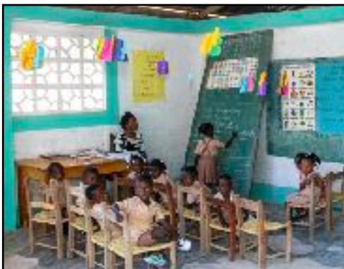
Sacred Heart School (Gold Gingham Uniforms)