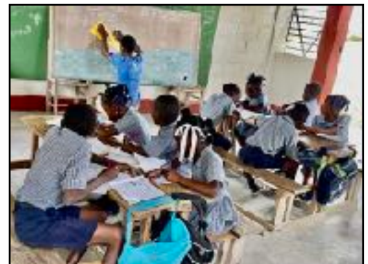
St. Anthony School (Blue Gingham Uniforms)