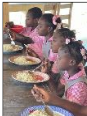
St. Joseph School (Pink Gingham Uniforms)