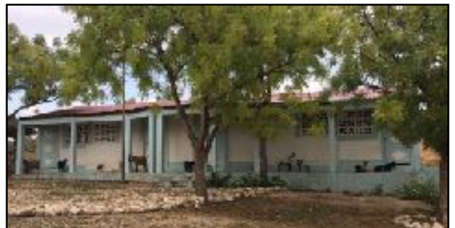
St. Joseph School, Côtes-de-Fer

Two years later, Father successfully secured a donation from Hope for Haiti to build three classrooms for a new elementary school in Côtes-de-Fer. Children who previously could not afford local schools were encouraged to enroll at the new facility. Our generous donations continue to support the schools by funding materials, uniforms, teacher salaries, and school lunches.